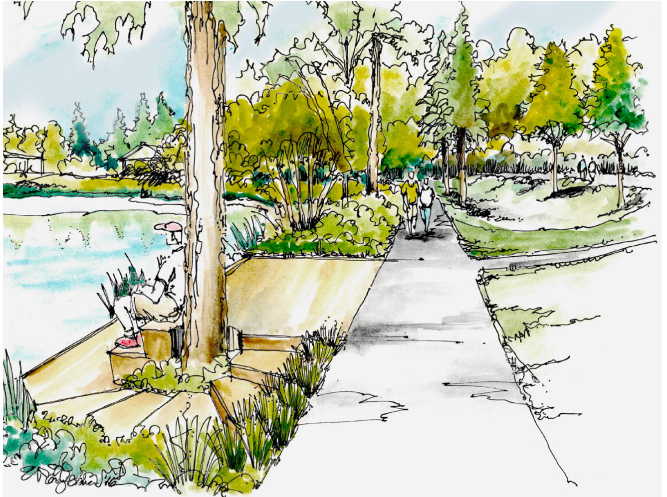
Promenade Sketch from Lake Boren Park Master Plan.