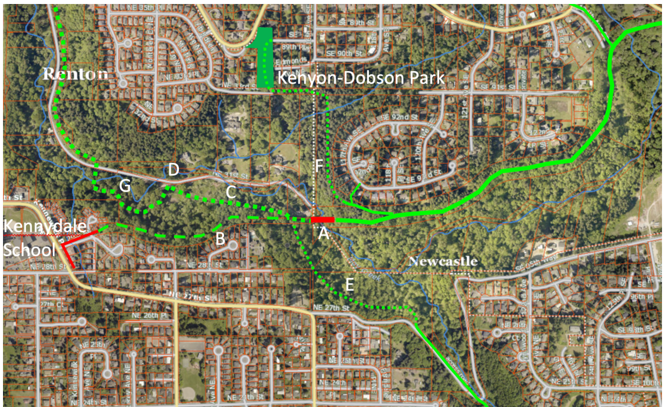
Figure 2. Renton-Newcastle Trail Projects

Newcastle Trails is a 501(c)3 nonprofit (founded 1999, 400+ members) dedicated to developing and maintaining trails in Newcastle (founded 1994). See www.newcastletrails.org ( Contract page) or read http://www.newcastletrails.org/doc/linking.pdf (5 pages, 3 maps, trail info) and http://www.newcastletrails.org/doc/expanding.pdf (2 pages, 2 maps, city comparisons).