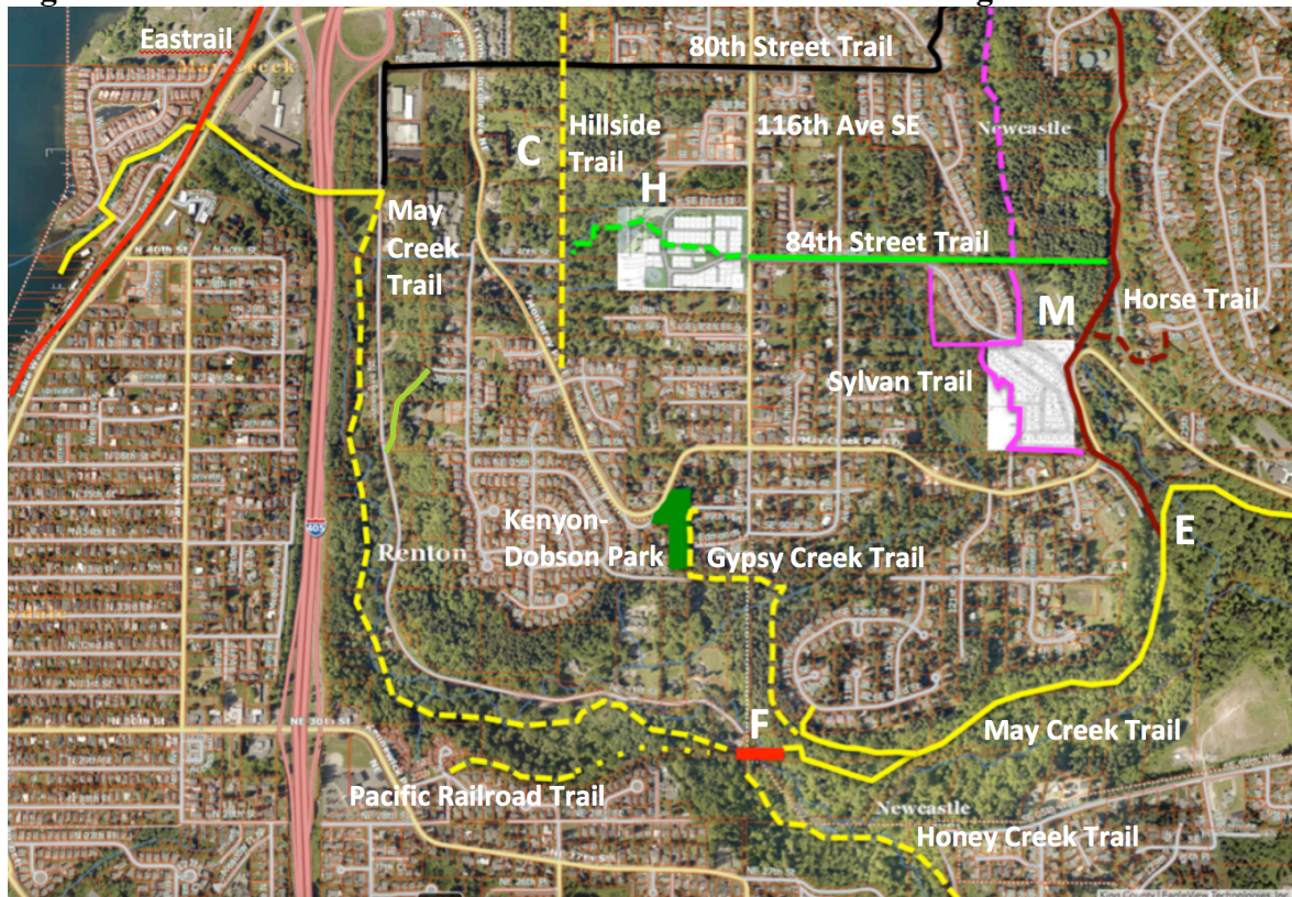
Figure 2. Trails in SW Newcastle and Renton Near the Footbridge